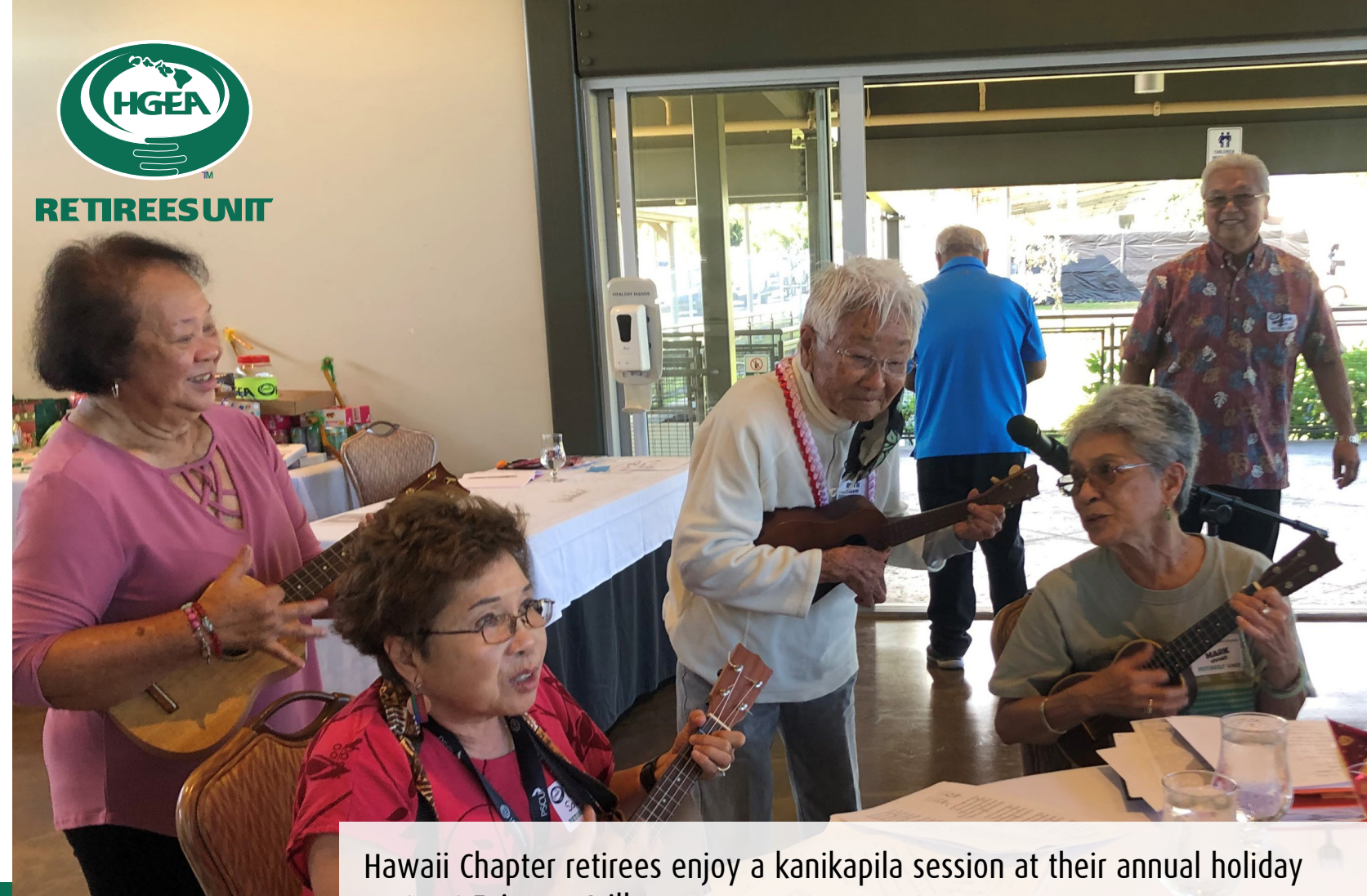
Hawaii Chapter retirees enjoy a kanikapila session at their annual holiday party at Fairway Grill.