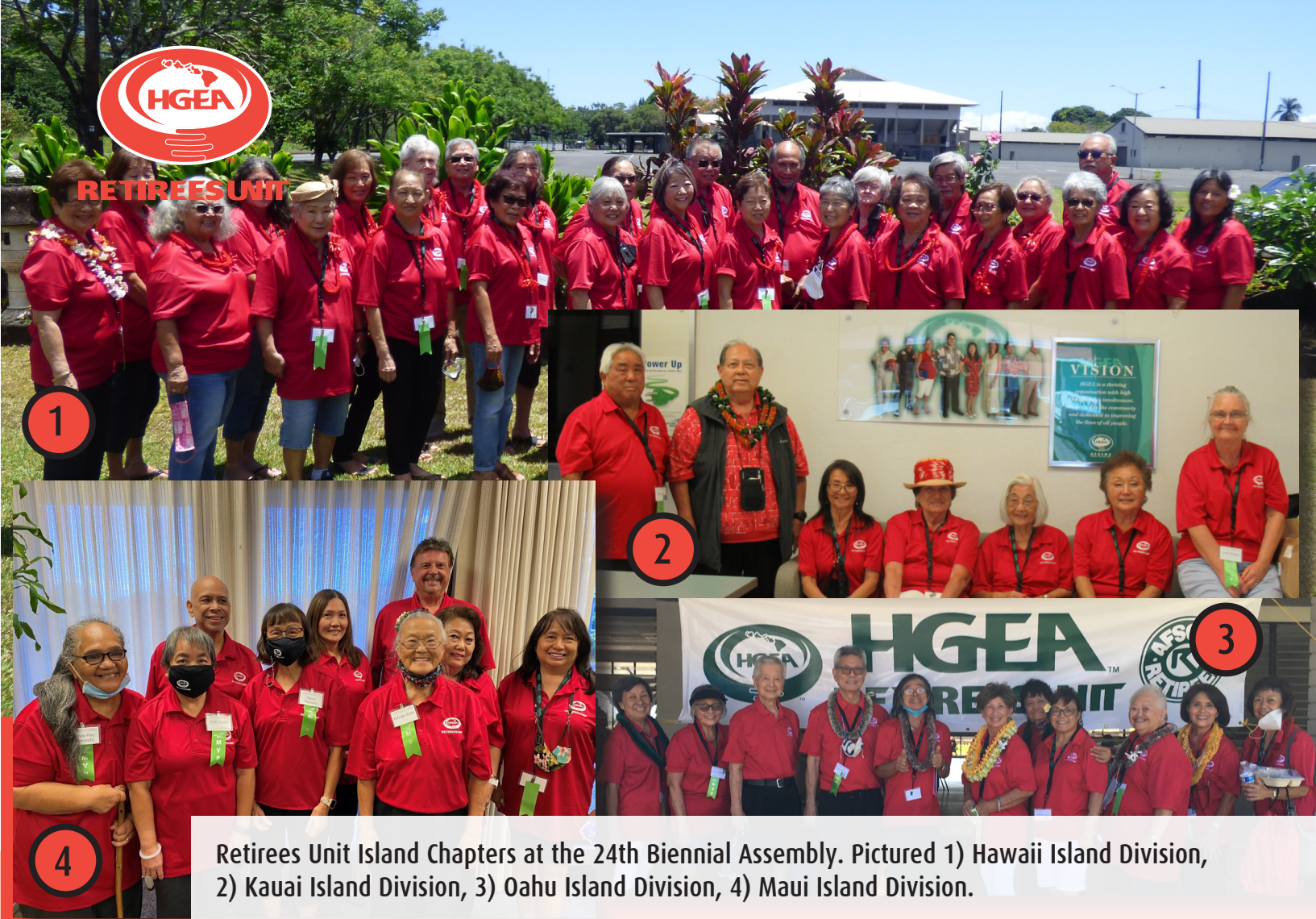
Retirees Unit Island Chapters at the 24th Biennial Assembly. Pictured 1) Hawaii Island Division, 2) Kauai Island Division, 3) Oahu Island Division, 4) Maui Island Division.

NON PROFIT ORGANIZATION U.S. POSTAGE PAID HONOLULU, HI PERMIT NO. 180